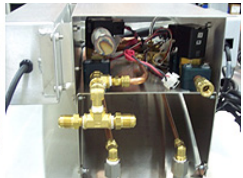
HE Plumbing Assembly