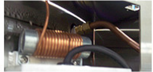
MVE Plumbing Assembly