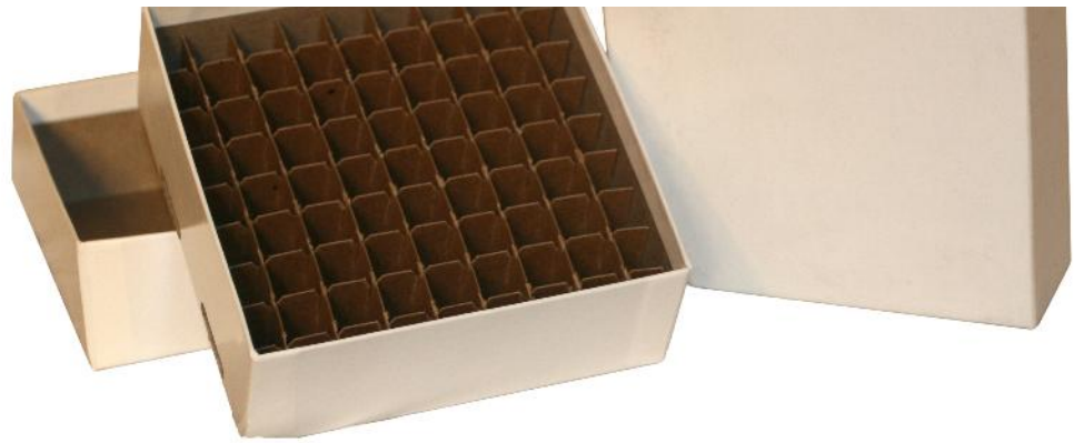
100 Vial Cardboard Box

9714099 Used for 81 external threaded vial-2" high 9714109 Used for 81 external threaded vial-3" high