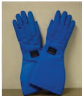
Chart sells cryogenic gloves in the following available sizes:

For maintenance recommendations please refer to page 99 of the TEC3000 manual; you can find this by going to: http://chartbiomed.com/knowledge/TEC3000TM.pdf