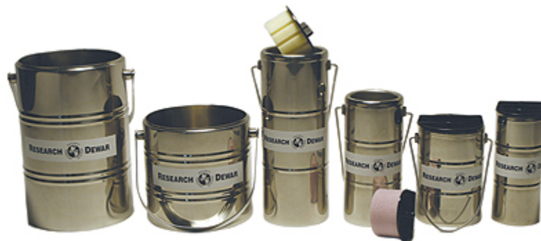
MVE Research Dewars (L to R): RD-6, RD-3, RD-2, RD-1, RD-1W, RD-0.5