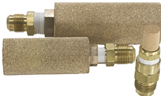
Small, Medium and Large Phase Separators