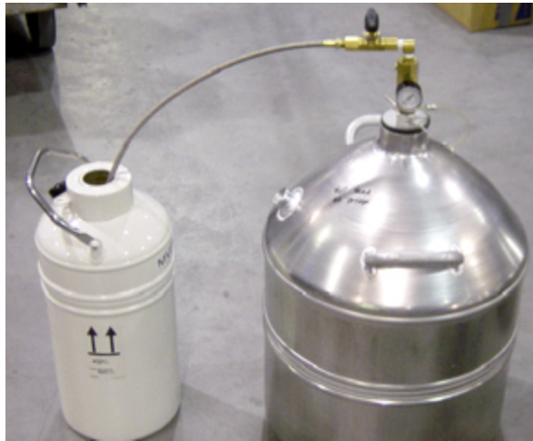
Stainless Steel Transfer Hose